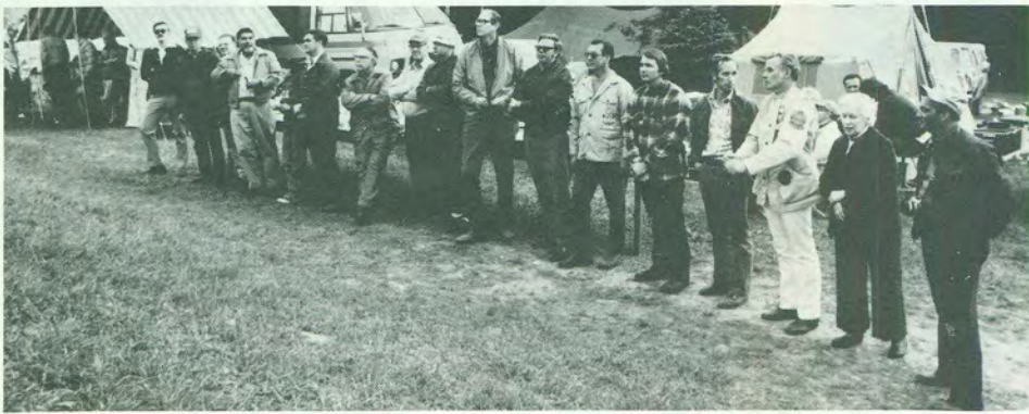
The top 20 at 100 yards during the preliminary competition.

For more Super Shoot II facts and figures see the August issue of Precision Shooting.