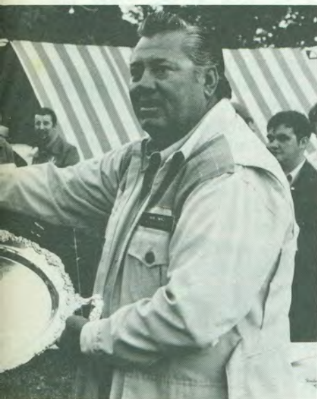
100 yards in the preliminary competition receives a trophy for firing a new IBS 5 shot group record of .0816 to win this range, during the Varmint and Sporter as good enough to win the Guns Magazine and