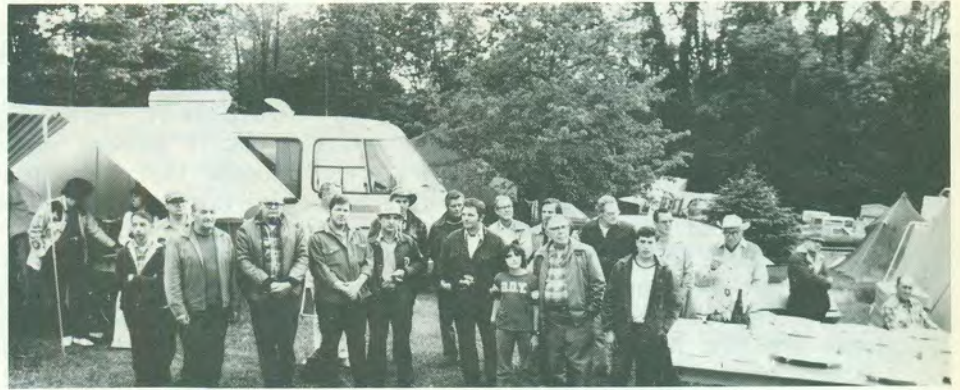
The top 20 at 200 yards during the preliminary competition gather around for the awards ceremony.