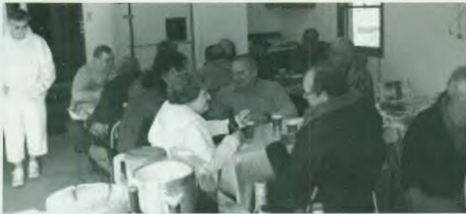
Photo #1 has many of the competitors enjoying the food and fellowship.