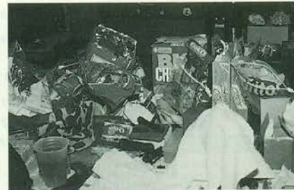
Lou Murdica's sustenance maintenance table in the loading barn. Lou, although a Californian, does not believe in health food. Notice there is not a single packet of trail mix, or a granola bar on the table.